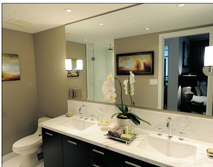
The show suite’s ensuite bathroom.

Together, the three participants, known collectively as Avra Development Corp., will be focused on erecting a building that Good says will be noteworthy on several counts. Windows will be virtually floor to ceiling, allowing residents to appreciate big views southwest to Semiahmoo Bay, eastward to the Fraser Valley, and north to the coastal mountains. Balconies will be unusually large. And then there will be the building’s roofline, designed to resemble a butterfly, its “wings” lifted slightly at either end. It’s a feature, says