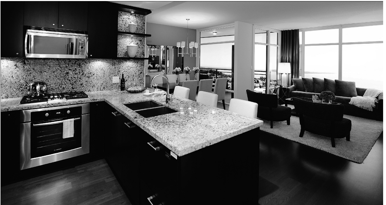
Expansive outlooks are the promise of an Avra address, and the show home has been designed to demonstrate that promise.